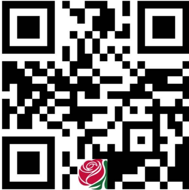
Scanning this QR code will link to the International website.