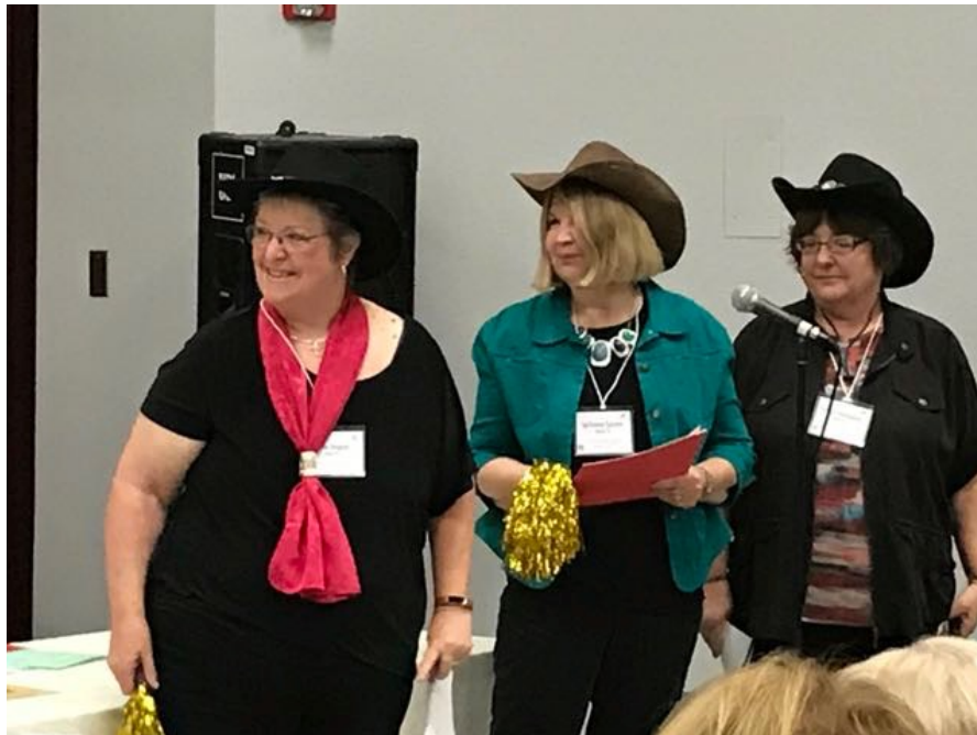
Publicity Committee Skit at Fall Workshops inviting members to Heart of the West State Convention in Prescott April 13-15, 2018