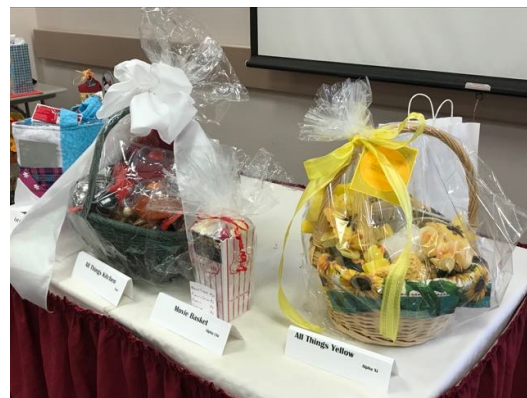
Some of the eight raffle baskets at Fall Workshop